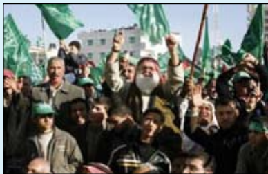
Gazans celebrate Hamas's 20th anniversary

So while Hamas is seen by many people inside the West Bank and Gaza as a legitimate defender - both politically and militarily - of the Palestinian people, most foreign governments do not share this viewpoint. Palestinians living under occupation often feel that Israel and its allies have stacked the deck against them, and Hamas is seen