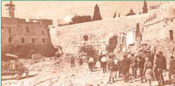
Inquiry Commission at the Wailing Wall

Annexation, population transfer, settlement construction, and destruction of private property are violations of Israel's obligations under the Universal Declaration of Human Rights, the Fourth Geneva Convention and the letter and spirit of the Oslo Accords.