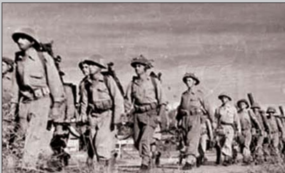
Having depopulated Lydda and driven Palestinian civilians towards the lines of the Arab Legion, Jewish troops march on Ramle to perform further expulsions.

The Jewish leadership was well aware of the lack of coordination among the forces they were facing, thanks both to intelligence technology and to contact with Arab and Palestinian individuals. Ben Gurion had always been keen to know to what extent Hajj