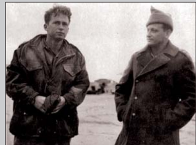
Yitzhak Rabin, then a commander on the Jerusalem front, and General Yigal Allon in 1948

In addition, the Zionists were aware of the logistical and political obstacles the Arabs were facing and knew that Arab armies would be incapable of or unwilling to come to the assistance of their allies. Ben Gurion admits in his memoirs that "we were victorious because the Arabs were weak and were subjected to unusual circumstances". 16 One of the major considerations behind his decision to attack the Egyptians in the Negev in the late stages of the 1948 conflict was his certainty that the other Arab states would not enter the battle. His gamble paid off, and the Transjordanians stood back as the Egyptians were routed by the Israeli forces.