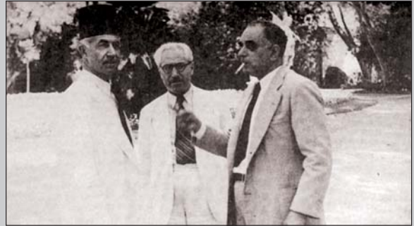
Former Syrian PM Saadallah al-Jabri, PM Jamil Mardam Bey and Iraqi PM Nuri as-Said consulting in the mid-1940s.

By the end of hostilities, the Syrians had penetrated just far enough to seize the strategic water resources near the border and were content to defend them for the duration of the military confrontation with Jewish forces without challenging them any further. They had taken no more than 66.5 square kilometers of land, and had denied the ALA any assistance as they were being driven north into Lebanon by the advancing Jewish forces.