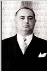
Colonel Husni al-Za'im

In spite of these words, Quwwatli was very aware of the inferiority of the Syrian army and was reluctant to engage in maneuvers that might leave his border with Transjordan vulnerable to King Abdullah's ambitions. When the Syrian regular army finally entered Palestine, Glubb Pasha estimated their numbers at only 3,000 of 4,500 available troops, while the CIA estimated a deployment of 1,000 troops by late June and 1,500 more near Syria's border. Heavy defeats in the first week of hostilities at Samakh in the Galilee and defended kibbutzim left 300 Syrian soldiers dead. The subsequent outcry by the parliament and press, accusing the government of failing to make adequate preparations for the war, forced President Quwwatli to fire both his Chief of Staff and his Defense Minister. The new appointee to the Defense Ministry was Colonel Husni al-Za'im, who would lead a coup against Quwwatli's government in 1949.