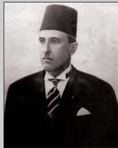
President Shukri Quwwatli

With these considerations in mind, President Shukri Quwwatli supported the Arab League's plans to create the Arab Liberation Army in order to delegate the expense and manpower of combat within Palestine to volunteers, enabling him to keep his troops close to Syria's borders. Just as importantly in the context of the political instability in the country, any defeat endured by the ALA would reflect upon the Arab League and not upon his personal leadership.