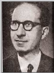
Tawfiq Abul Huda

In January 1948, Abul Huda, accompanied by his Foreign Minister Fawzi al-Mulki and Transjordan's British commander of armed forces Glubb Pasha, traveled to London to meet with British Foreign Secretary Ernest Bevin. According to Glubb, the Transjordanian government proposed to send the Arab Legion across the Jordan when the Mandate ended to take control of that part of Palestine awarded to the Arabs which was contiguous to Transjordan. Glubb tempered this plan by reminding Abul Huda that the Arab Legion would not be able to hold the Galilee or the Gaza area. Bevin agreed with the proposal, adding that "it seems the obvious thing to do, but do not go and invade the areas allotted to the Jews." To this the Transjordanian PM replied that "we would not have the forces to do so, even if we so desired." 11