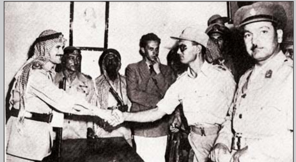
Above: Generals Abdullah Tal of Transjordan and Moshe Dayan meet to discuss the partition of Jerusalem.