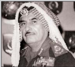
Habes al-Majali, under whose leadership Arab Legion forces repelled Jewish attacks at Latrun

The initial fighting between the Arab Legion and Jewish forces was fierce in spite of the agreements between King Abdullah and the Zionist leadership. While the Arab Legion remained within the area designated as Arab in the UN Partition Plan as agreed, the Jewish troops attempted to push into the Arab-designated area towards Jerusalem. The former British fort at Latrun that controlled the Tel Aviv-Jerusalem road was within the Arab area, and was held by the Arab Legion in the face of Jewish attacks. Meanwhile Jewish assaults on Jerusalem's Old City were repelled by Jordanian troops.