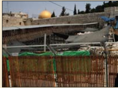
Excavations at Mughrabi Gate

The Mughrabi Gate , an Al-Haram Ash-Sharif gate facing westward, is closed to Muslims and exclusively under the control of the Israeli authorities, while all other gates of the Haram Ash-Sharif are open to Muslims and admin-