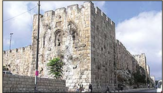
Burj Al-Laqlaq from the outside

The plan was first disclosed in 1990 by then Housing Minister Ariel Sharon, who announced the intended construction of 200 housing units at the site. Another plan was ratified during the tenure of Prime Minister Netanyahu, this time envisioning the construction of a religious school, two six-floor residential buildings, parking lots, and two underground tunnels. In May 1998, settlers from Ateret Cohanim - protected by Israeli soldiers - laid the 'cornerstone' for the new settlement