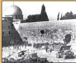
The Quarter in front of Al-Buraq Wall prior (l) and after (r) its demolition.