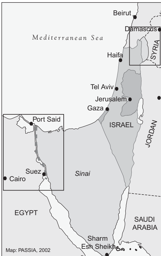
The Egyptian Front at the Cease-Fire of 26 October 1973