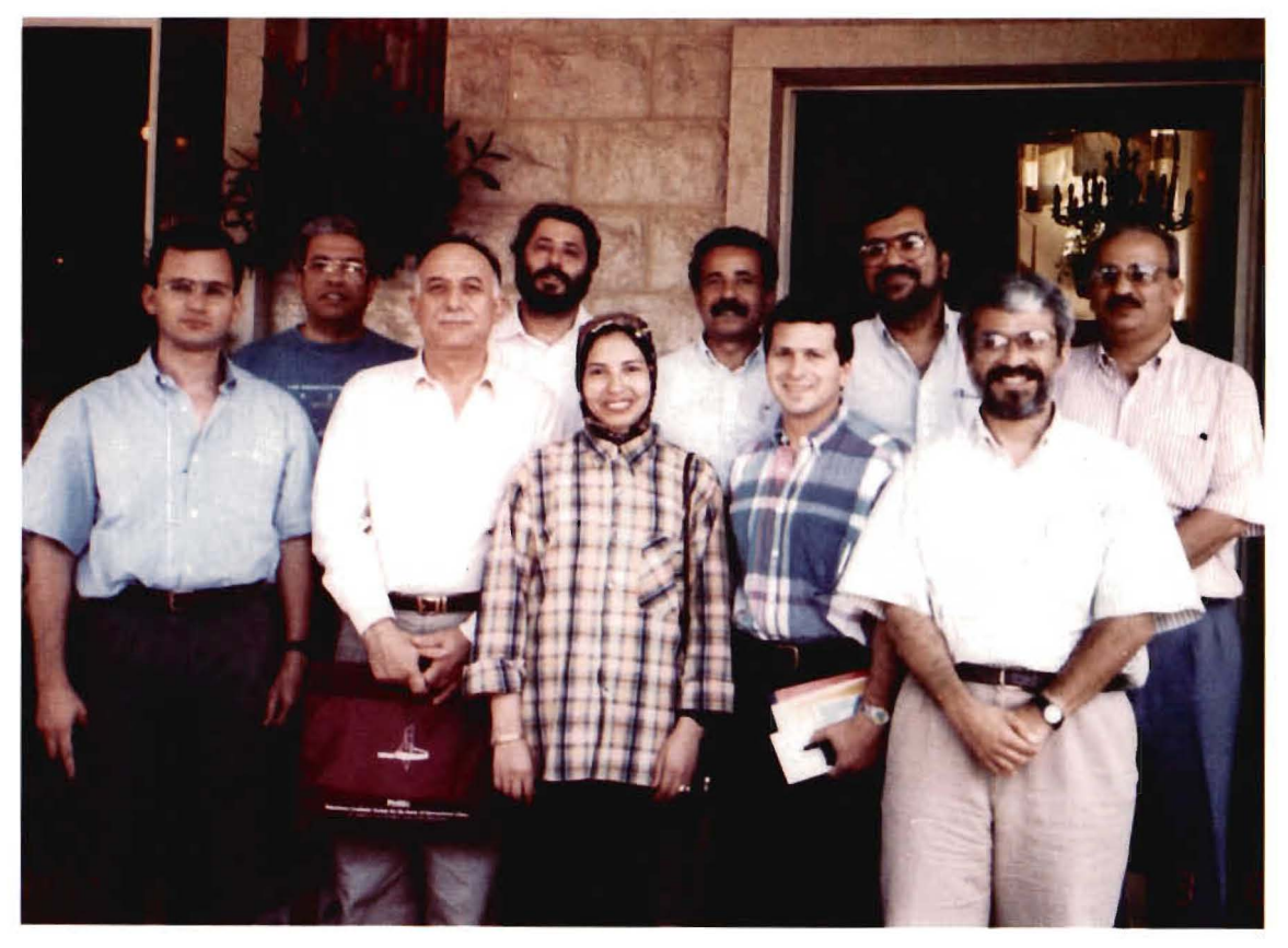
Meeting of Regional Arab Research Centers, hosted by the Lebanese Center for Policy Studies, Beirut