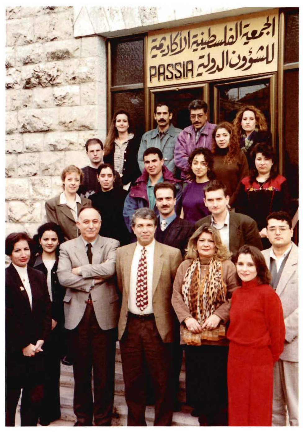
PASSIA Seminar 1996 "The Foreign Policies of Arab States": Participants and Lecturers