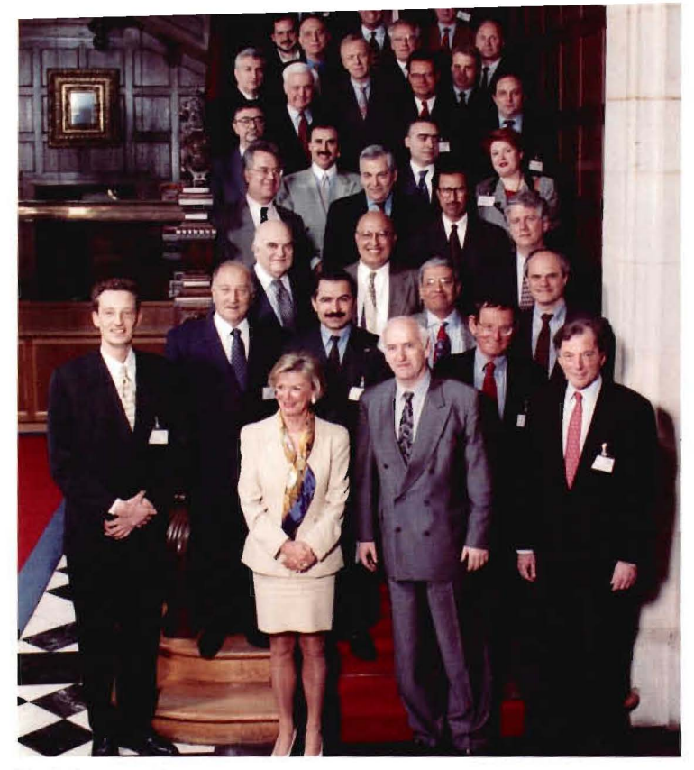
Bertelsmann Foundation, Second Annual Conference on "Europe and the Middle East: Dialogue for Future Oriented Cooperation", Schlosshotel Kronberg.