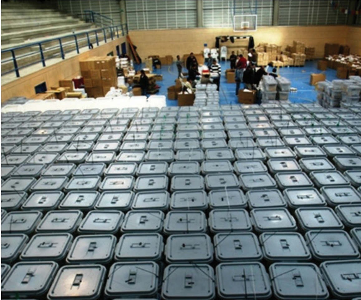
Collected ballot boxes, 2006 elections.