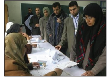
Voting in East Jerusalem, 2006

Even though they eventually were allowed to cast their ballots, poor communication and overall confusing and changing instructions contributed to the fact that the Jerusalem district had the lowest turnout of all 16 districts. 80