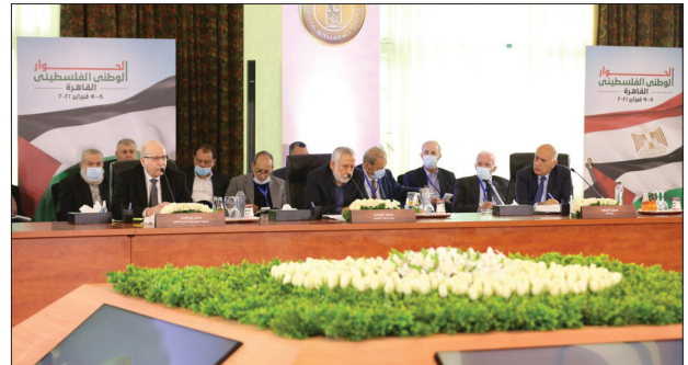
Cairo meeting, February 2021

During a two-day meeting in Cairo on 8-9 February 2021, 14 Palestinian factions discussed the PA legislative and presidential elections and agreed to abide by the timetable set by the presidential decree of 15 January 2021. The Fatah delegation was headed by Jibril Rajoub and the Hamas delegation by Saleh Al-Arouri. PIJ announced it would boycott the elections because of its disapproval of the PLO's agreements with Israel, but pledged not to obstruct them. 29 Discussion of the PNC elections was postponed to a second round of talks in March. 30