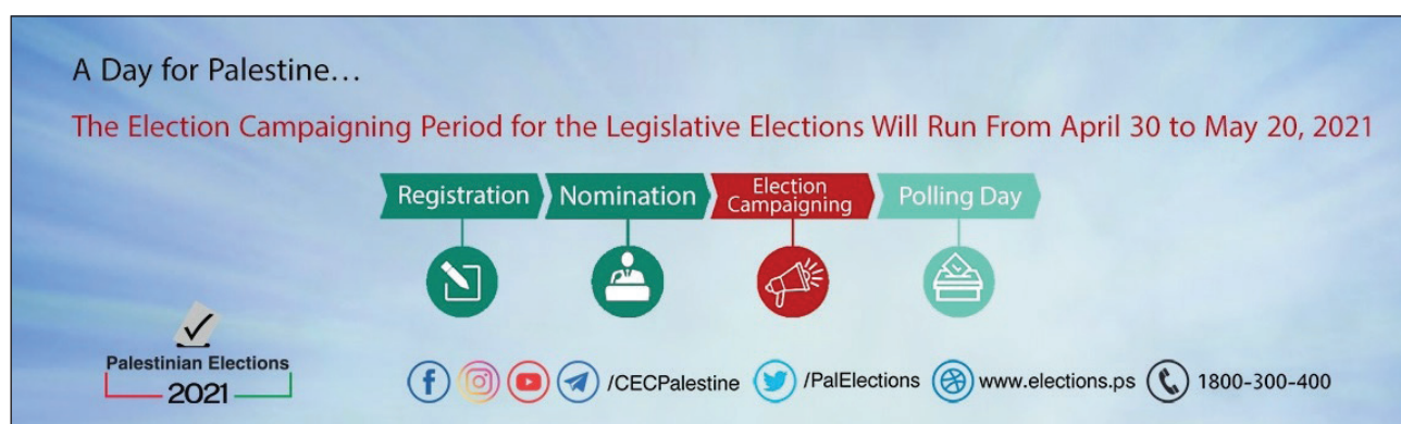
CEC's election campaign process as announced on its website.

On 6 April 2021, a week after the closure of the nomination period (31 March 2021), the CEC published the preliminary electoral lists. Objections could be submitted until 8 April 2021, and on 11 April the CEC issues its decision on the 231 objections received, approving only one due to acquiring Israeli citizenship (in violation of the provisions of Decree Law No. (I) of 2007). Subsequent appeals before the Elections Court were possible, but all 18 appeals were dismissed, marking the closure of the candidacy phase. 156 According to the electoral calendar, nomination could be withdrawn until 29 April after which final lists were to be published and the electoral campaigning period to begin on 30 April 2021. All 36 lists that submitted their nomination applications were accepted; 7 of them were from political parties, and 29 were independent lists. The splitting of Fatah into several lists, coupled with the overwhelming number of independent (partly technocratic) lists and a 1.5% threshold, would have most likely disrupted the usual Fatah or Hamas political continuum.