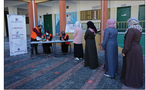
Voter registration in Khan Younis

On 17 February 2021, the CEC announced that 93,3% of eligible voters (a total of 2.6 million) registered to vote. Residents of East Jerusalem with Israeli-issued ID cards did not have to register. In the preliminary voter registry, women constituted approximately 49%, while first time voters made up about half of the 2021 electorate. 182