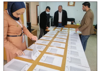
Citizens looking at preliminary electoral lists

Many observers believed that President Abbas' call for elections was primarily a stunt, an olive branch directed at Biden. After four years of the Trump administration that proved to be nothing less than disastrous for the Palestinian cause, many hoped for an improvement with the new American President. It may be that the initial call for elections was indeed directed at Biden and other Western donors, signaling Palestinian democratic efforts to bring back accountability. On the other hand, it was clear that President Abbas would need to renew his legitimacy and that Hamas was suffering from sanctions, border controls, and lack of PA payments. Nevertheless, the continuation of actual preparations (the CEC's work, the successful registration, the Cairo talks, the publication of electoral lists) for elections surprised many (including Israel and perhaps even President Abbas himself).