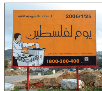
Poster from the 2006 Elections

The PLC elections took place on 25 January 2006 after an amendment to the Elections Law No. 9 of 2005, increasing the number of PLC seats from 88 to 132 and introducing a mixed electoral system amongst other changes. Of the registered voters, 77% turned out on election day, resulting in a surprising landslide victory of Hamas, which obtained 74 as opposed to Fatah's 45 seats. 191 Elections overall met international standards despite some smaller issues and obstruction in East Jerusalem. However, the international community was shocked to see Hamas, a designated terrorist group in the eyes of many, win, and refused to enter into relations with a Hamas government, imposing sanctions. 192