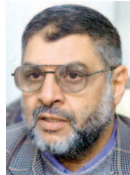
Abdul Aziz Rantisi