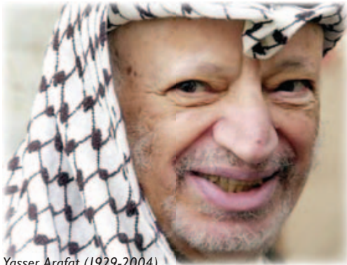
Yasser Arafat (1929-2004)

The month of November was dominated and overshadowed by news surrounding the deteriorating health and eventual death of Pres. Yasser Arafat. On 2 November, a statement by French doctors treating Arafat indicated that his condition was improving and ruled out a diagnosis of leukemia. The next day, however, it was reported that the Pres.'s condition had deteriorated, that he had been placed in intensive care, and that no visitors