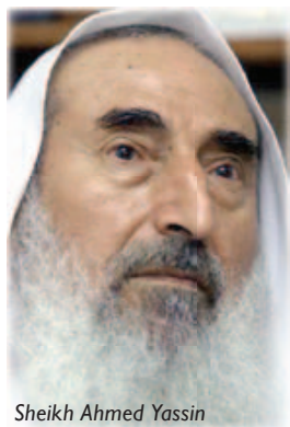
Sheikh Ahmed Yassin

Hamas' overall leader. On 25 March, some 60 prominent Palestinian officials and intellectuals published an advertisement urging the public to refrain from seeking revenge for Sheikh Yassin's death and igniting a new round of bloodshed that would only hurt Palestinian aspirations regarding independence.