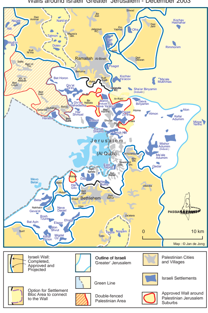
Walls around Israeli 'Greater' Jerusalem - December 2003

The fourth and final part of the agenda comprises, a Palestine Chronology 2003, a full list of PASSIA publications, as well as a selection of colored maps , including one on Israeli settlement policy in the West Bank and several of the separation wall.