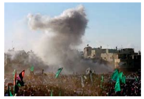
Explosion at a Hamas parade in Jabalia RC

border with Egypt in a bid to impose order. On 21 September, Israel declared its border with Gaza an international boundary, and a day later, Israel's Disengagement Plan was completed with the dismantling of the Dotan military post near Jenin. Israel's announcement that all