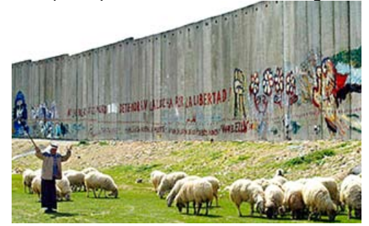
The Separation Barrier (The Wall) at Abu Dis

PA reforms. As further proof of the spreading dissatisfaction, members of Al-Aqsa Martyrs Brigades attacked the Muqata'a and restaurants in Ramallah, and gunmen marched in Tulkarem, Jenin, and Nablus as well as in Gaza. In Jerusalem, meanwhile, further land was confiscated for the construction of the separation barrier in Sawahreh, Izzariyya, Abu Dis, and near At-Tur, while tenders for additional housing in