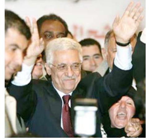
New Palestinian President: Mahmoud Abbas

destruction, especially of Palestinian houses in the Gaza Strip, and continued suffering. On 21 January, Pres. Abbas ordered PA security forces to take up positions in northern Gaza to curb "attacks" on Israelis as part of his plan to revive peacemaking efforts. Israel reopened the Rafah border crossing between Gaza and Egypt - closed since 12 Dec. 2004, at which time thousands of Palestinians found themselves stranded on the Egyptian side